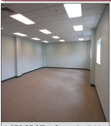
1.070 SF Office Space Available

The MVEDP currently has office space available at the Moshannon Valley Regional Business Center.