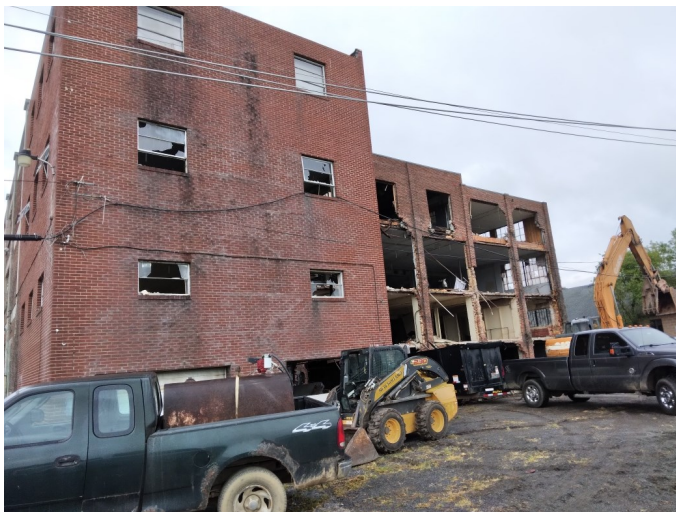
Photos of the dilapidated old buildings on Water Street.