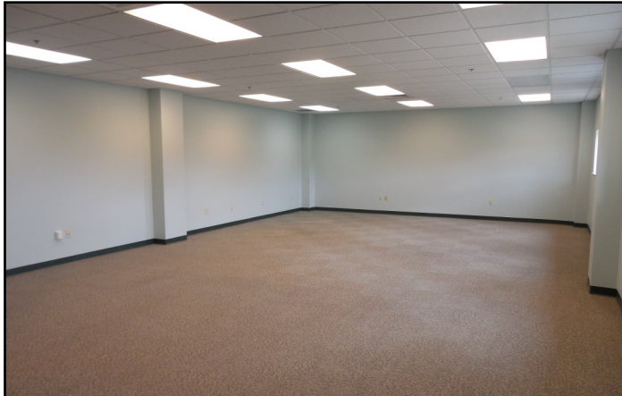
MVRBC Office Area, 1,070 SF

The Partnership still has some space to rent at the Regional Business Center located in the Business Park facility. The Center is located across the street from Hogs Galore.