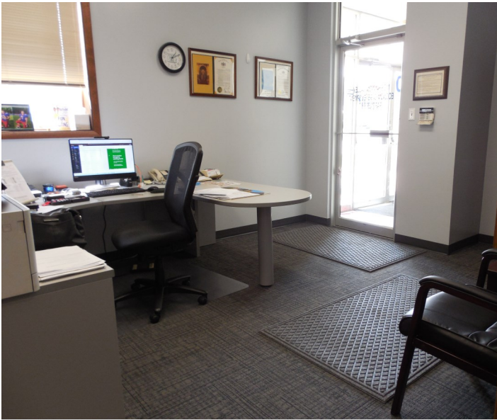
Main Reception Office Area