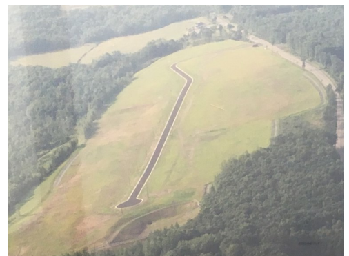
Moshannon Valley Regional Business Park “Field of Dreams”

The Business Park was once called the “Field of Dreams.” The area resident that wrote the Letter to the Editor calling it that believed that this new site would provide no benefit to the area. The Park was developed in 2000/2001, and officially opened in July 2001. There were originally fourteen (14) lots, but two were subdivided making a total of 16 lots that were sold to businesses.