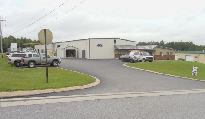
Advanced Powder Products