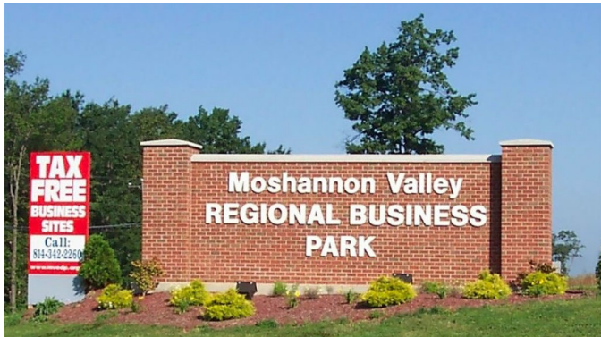
Moshannon Valley Regional Business Park

It was in 1998 when the MVEDP staff and board of directors began to explore the potential development of a business park to serve this region. To accomplish economic development, an organization like the MVEDP must have the tools to offer businesses and those include building space, financing, and land.