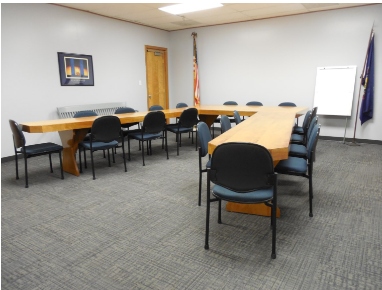
Large Conference/Board of Directors Room

The MVEDP office continues to be located in the former General Cigar building, now the Moshannon Valley Enterprise Center. For the first time in over 30 years, the office has been remodeled with new carpet, wall paint and baseboard trim. The office looks very professional and much more modern that it did before. Carpet One installed the new carpet and did a great job. New electronic equipment has been added which will allow for on-line streaming of the MVEDP’s board of directors meetings.