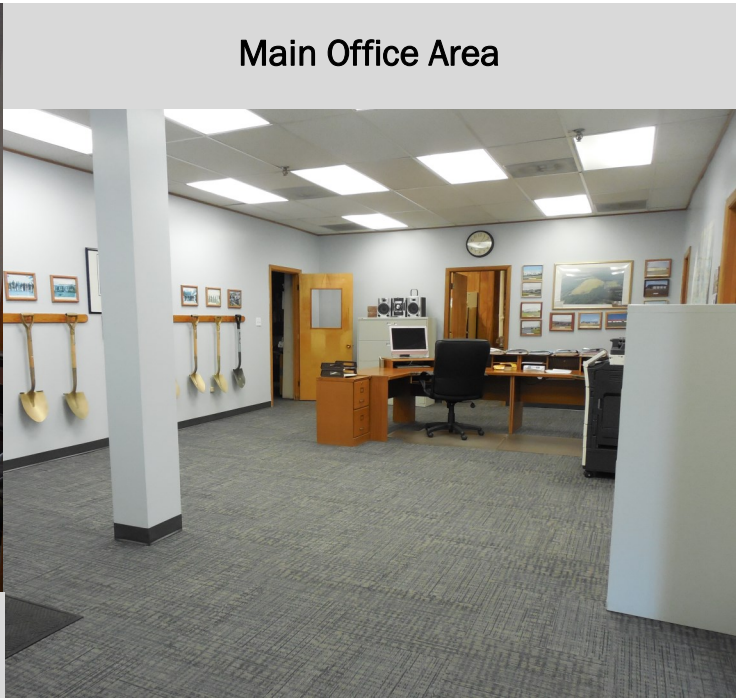
Main Office Area

The MVEDP office continues to be located in the former General Cigar building, now the Moshannon Valley Enterprise Center. For the first time in over 30 years, the office has been remodeled with new carpet, wall paint and baseboard trim. The office looks very professional and much more modern that it did before. Carpet One installed the new carpet and did a great job. New electronic equipment has been added which will allow for on-line streaming of the MVEDP’s board of directors meetings.