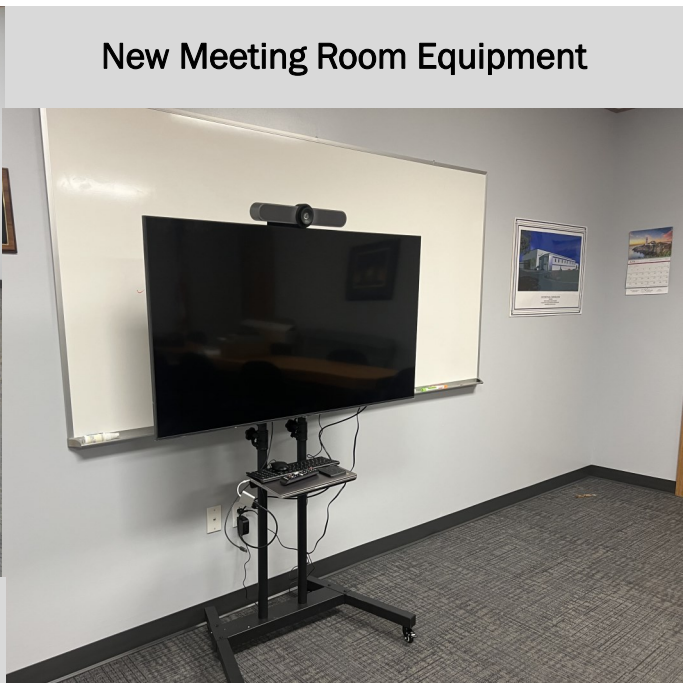
New Meeting Room Equipment