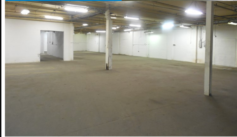
Suite 130-B 11,000 sf.