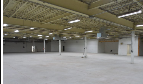
Suite 130-A 15,000 sf.