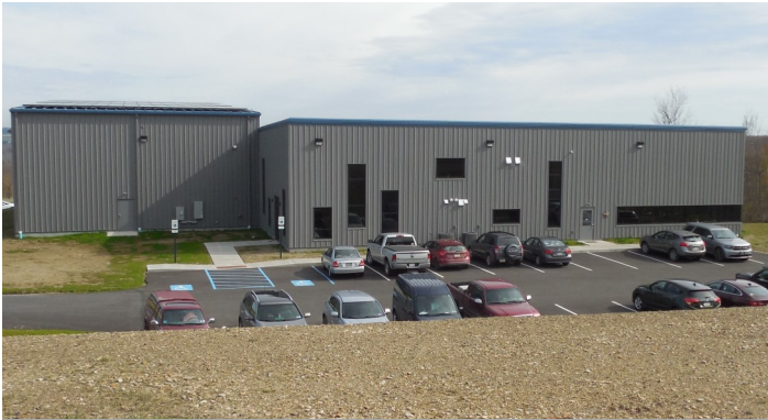
Organic Climbing, LLC

ball games. There was nothing of major historical significance to the site, so the Partnership packaged up the information and sent it to Harrisburg and this work was accepted saving the Partnership the consultant fee.