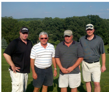
First flight winners.