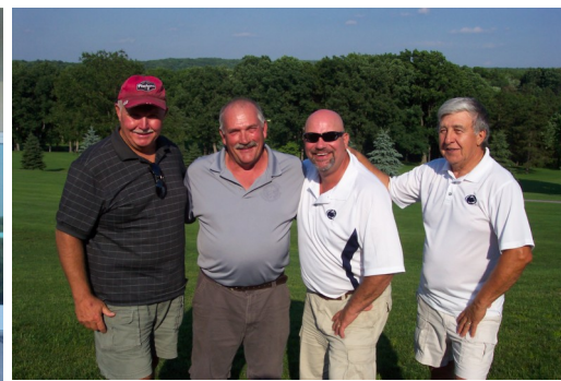
Third flight winners.

This is the fourth year the MVEDP has solicited sponsors for the event and it was very successful! Thank you to our prime sponsors: Hawbaker Engineering, Keller Engineering and Christoff Mitchell Petroleum.