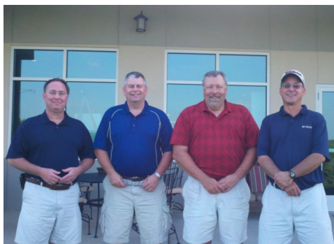
Second flight winners.