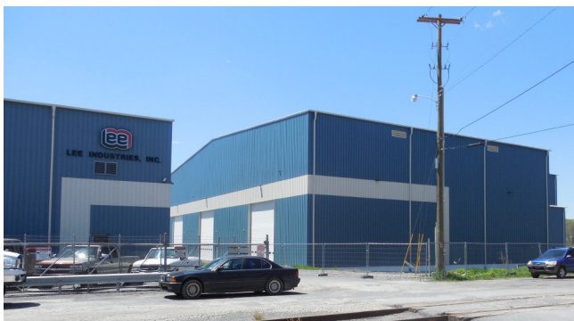
Lee Industries - Expansion Project