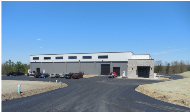
Diamondback Automotive Accessories - Construction nearing completion.